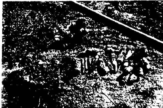
Fig. 5. Penetrators and fused masses recovered from the bonfire.

A small fragment (about 3 x 5 cm) was located the day following the test ~700 ft from the bonfire. This is 350 ft beyond any other fragment location in this test and 240 ft beyond any fragment location in three earlier tests performed at Eglin AFB on similar ammunition containing the same cartridge case and equivalent propellant load. 5 The low mass of the fragment and its extreme distance from the bonfire suggest that this is an artifact due to some mechanism of transport other than ballistic projection. Wildlife in the area, ravens in particular, are frequently attracted to shiny metal objects such as this fragment, and are known to move objects even larger than this fragment. We consider this the probable explanation and have omitted this fragment from pattern scoring of the test. Complete scoring data sheets have been forwarded to AFATL, Eglin AFB.