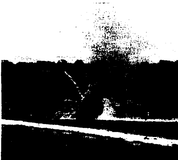
Fig. 4. Telephoto of the bonfire midway through burn.

The temperature recorder (and samplers) was started 4 min after squib firing. Temperature history is summarized in Table III. All four thermocouples responded but only No. 1 and No. 3 reached the expected temperature. Table III indicates peak temperatures and the temperature 10 min after squib firing, to correspond (within ±1 min) with the first shell disruption. Thermocouple 1 was located